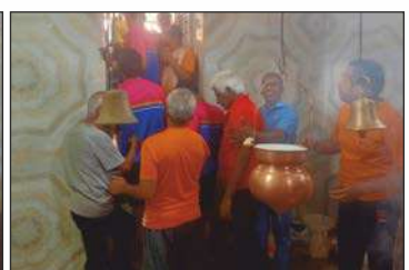
Short Picnic - Our Badlapur children visited Shiv temple Rahatoli on an auspicious day of ShivRatri.