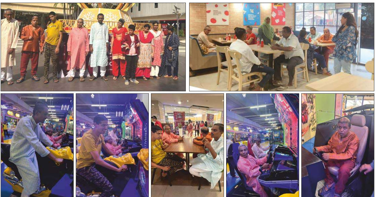
MANN organised Christmas party for children. They enjoyed at Kalyan Metro mall with MANN TEACHERS.