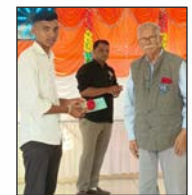
Adesh Keru Rongate H.S.C - 48.67%