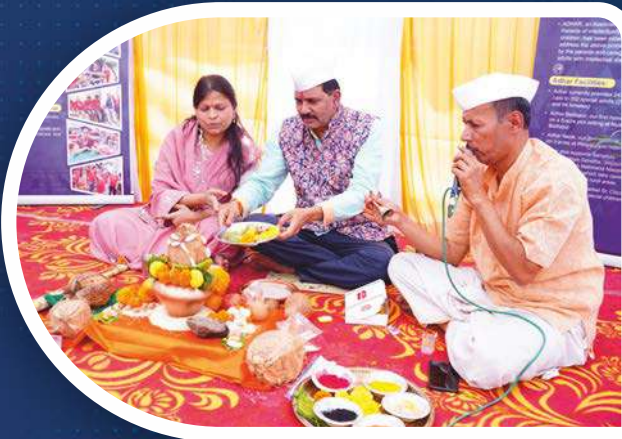
Adhar Satara Project Bhoomi Pujan