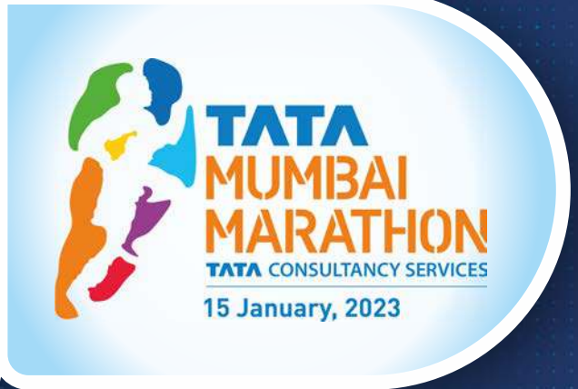
Adhar wins awards at Tata Mumbai Marathon 2023