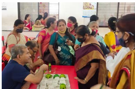
dormitories. They spent quality time with our special ones in the workshop. They also enjoyed the dance perfor-