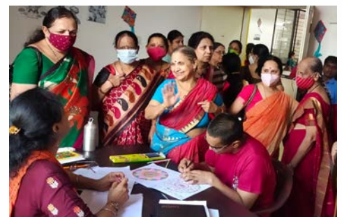
mances by our residents. Their visit concluded with sweet memories of Adhar.