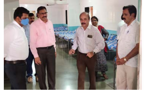
Chandak was very impressed with the facilities provided for the residents.