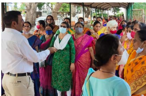
The Ladies social group from Dombivli visited Adhar. They toured the entire campus including the workshop and the