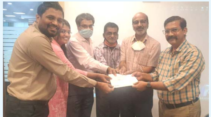
The staff members of Gunnebo Pvt. Ltd. Khopat, Thane, donated a handsome amount to Adhar.